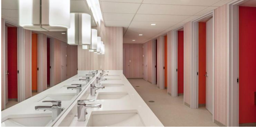
PASBO 62ND ANNUAL CONFERENCE AND EXHIBITS, PITTSBURGH